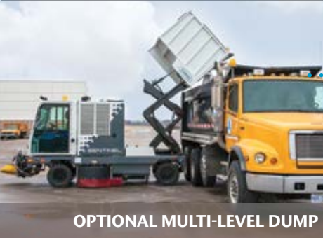
OPTIONAL MULTI-LEVEL DUMP

..... Optional 9.5 ft / 2,900 mm multi-level dump, with hopper overload indicator, enables you to easily empty debris in most places you need.