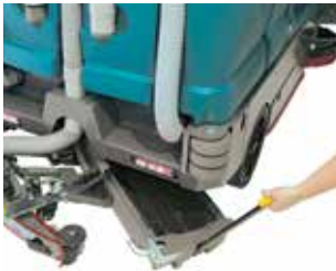
EZ-REMOVE DEBRIS TRAY

Lower maintenance and repair costs with a heavy-duty rear squeegee protection kit that prevents damage to the machine.