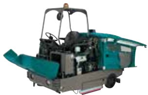
EASY OPEN SERVICE

EZ-Remove™ debris tray glides in and out on wheels, improving productivity and operator safety. The convenient and sturdy handle simplifies debris transport and disposal.