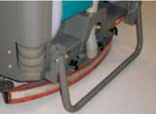
SQUEEGEE PROTECTION KIT

Achieve outstanding cleaning results in the harshest industrial environments with dual cylindrical brushes or three gimble mounted disk brushes for aggressive cleaning.