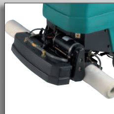
1610 - Rollers for maintenance cleaning