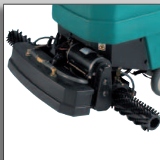
1610 - Brushes for restorative cleaning