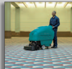
Machine in action